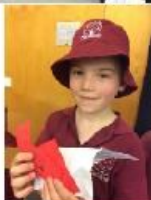
Lots of us came to watch.